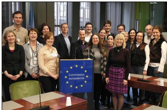
The PREDI-NU consortium during the 2nd project meeting at the European Commission in Luxembourg, February 2012