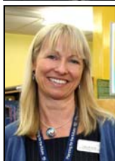
The members of the Scientific Advisory Board